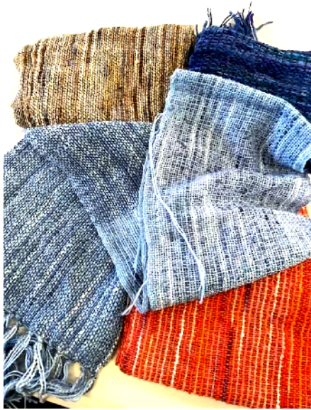
Takumi finished an abundance of lovely scarves on his handmade loom (2 ply and 4 ply).