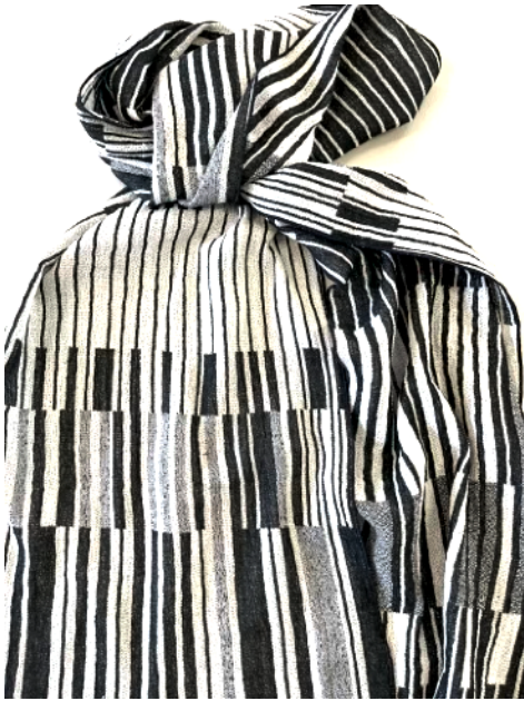
Monique, Nuno Textiles scarf in double weave