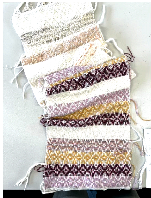
Necia, Overshot project exploring different weft yarns.