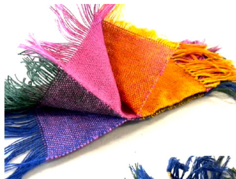
Liz, Multi-layer samples.