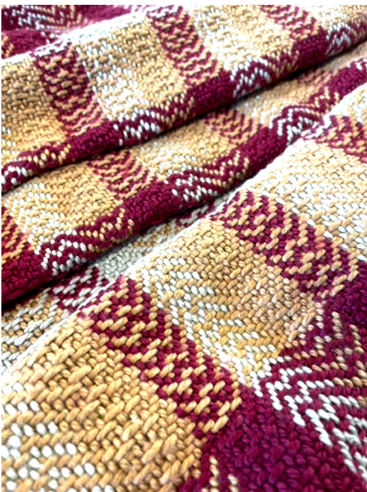
Polly, Cotton blanket project. Polly showed us extreme deposits on her reed and said it was a “horror” to weave (but it looks great!).