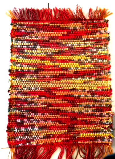
Pat, Repurposed checked linen tablecloth into a rag rug placemat with 8/4 coloured cotton warp.