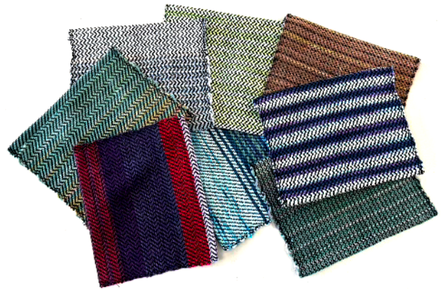
Kate, Dishcloths / samples made from thrums.